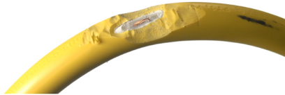
Pictured: Damaged power cord with exposed wire.