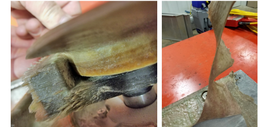
Pictured: Large amounts of wax build-up.