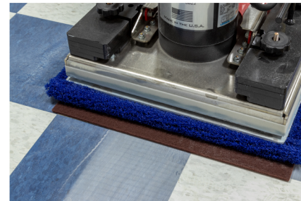
Pictured: Tile & Grout pad incorrectly used as a driver pad.