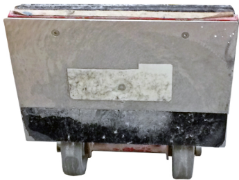
Pictured: Incorrect grip face applied to the machine.