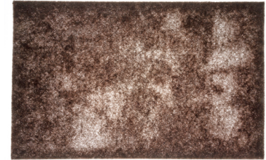
Pictured: Overused pad.