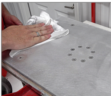
5. Clean the plate with 91% alcohol and a lint free cloth. Let plate dry for 5 min. Remaining steps should be done within 15 minutes of completing step 4.*