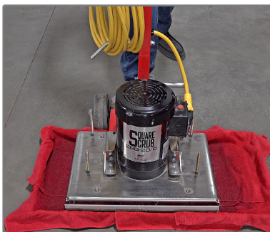
2. Place plate face down on a Xylene soaked towel for 30 min.