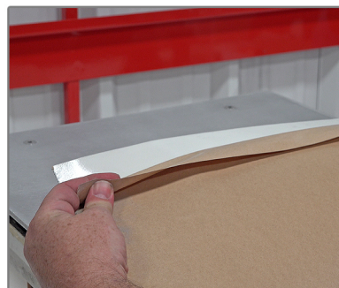
6. Remove back liner of the new grip face 2" from the long edge.