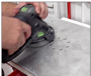
4. Abrade the plate using an orbital sander with 80 grit sandpaper to remove a very thin layer of aluminum evenly.