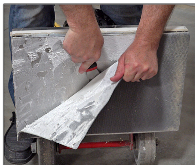
1. Remove old grip face from the plate.