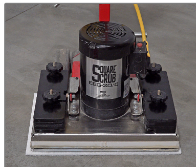
9. Set machine upright on a driver pad for 24 hrs with machine weights before using.