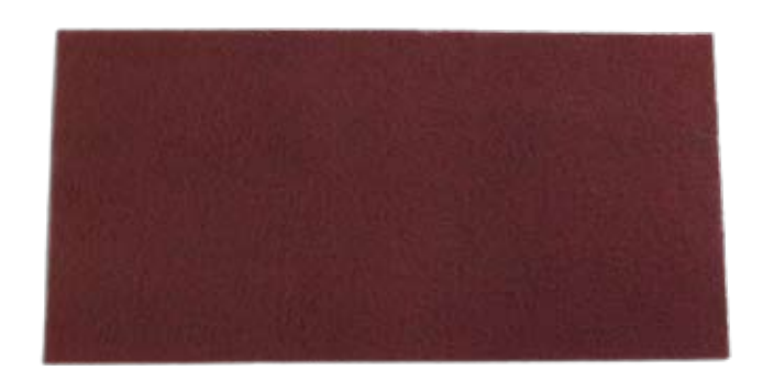
SQP (Square Prep Pad)

IMPORTANT: Make certain a driver (or spacer) pad is used between the machine and your SQP. The driver pad will be either blue or red and is approximately 1" thick. This will help protect the surface and the machine. Check driver pad every 30 minutes for excessive wear. Replace if worn or thin (less than 1/2").